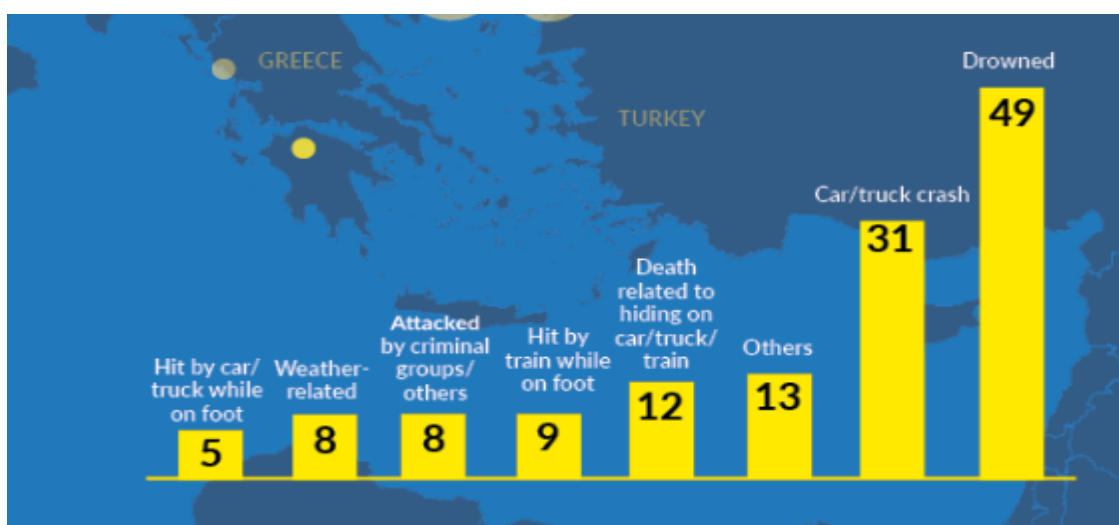
Fig 2: Dead and Missing along land route