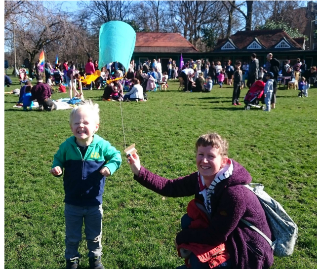
Fly Kites Not Armed Drones. Took place in the Meadows. Sunday 7 April. At the Meadows Pavilion Café.